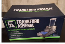
Frankford Arsenal Intellidropper Powder Measure - $200