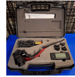
MagnetoSpeed V3 Ballistic Chronograph $250

Contact Mike Skora at 603-303-2861 to purchase any or all of the above three items.