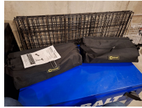
Caldwell Ballistic Precision Chronograph $75 ea